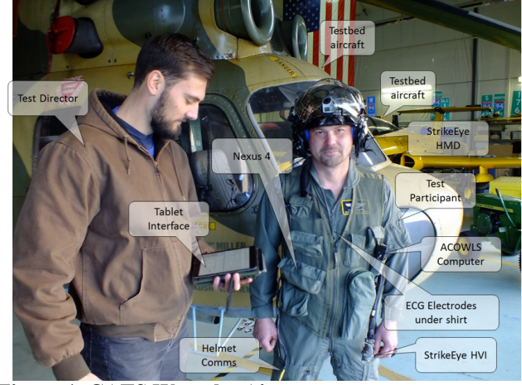
Figure 1. CATS Worn by Aircrew

We divided the CATS system into two separate areas: a Sensor Kit (SK) which includes all sensors and data collection hardware (ostensibly to be used in the operational environment) and an Analytics Application (AA) which encompasses the analytical